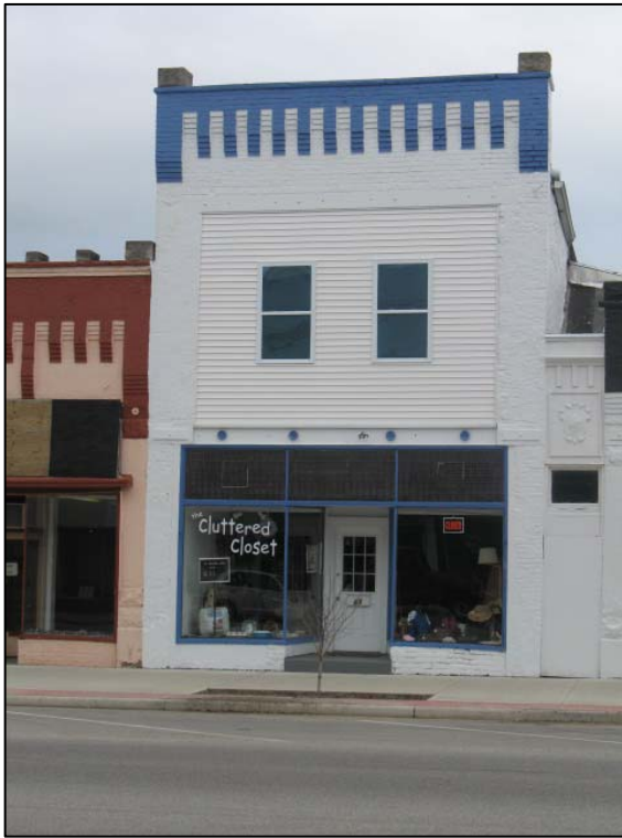
65 North Broadway in downtown Peru as it looks today. Between 1891 and 1912, the second floor of this building served as the Or Zion Synagogue.

community and still exist, so that they could be documented and added to the Indiana Historic Sites and Structures Inventory. Many Hoosiers may not realize that both Peru and Logansport hosted vibrant Jewish communities during the late nineteenth and early twentieth century, with many downtown merchants and civic leaders identifying as Jewish and both county seats including Jewish cemeteries.